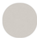
Reconstructed stone white Calce X131