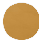
Reconstructed stone yellow onyx X133