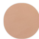
Reconstructed stone pink onyx X134