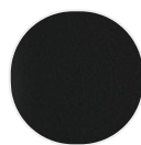
Reconstructed stone black slate X132