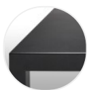
Goffered matt painted black iron X130