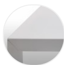
Goffered matt painted white X124