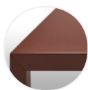
Goffered matt painted corten X128