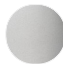
Reconstructed stone Serena X084